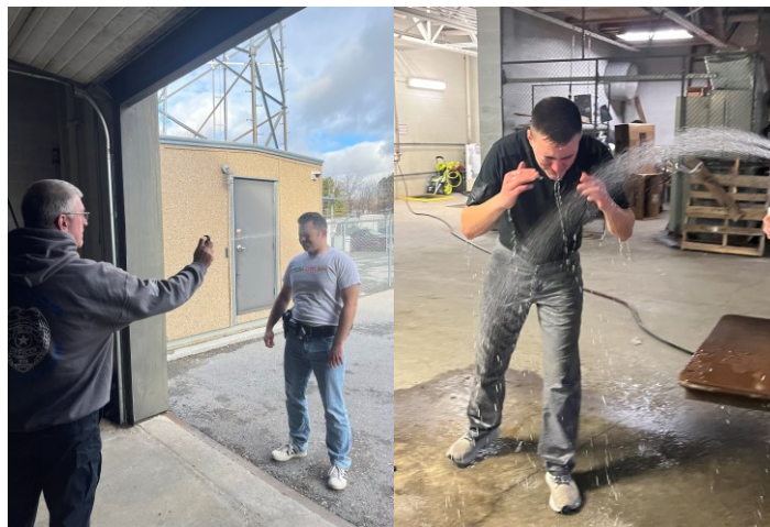
Recruit Officers participated in aerosol subject restraint training (better known as pepper spray)

The Black River/St. Lawrence Police Academy Class of 2024-2025 is now in the eighteenth week of classes. Over the past few weeks, the recruits have been training in topics such as: domestic violence, physical fitness & wellness, NYS First Responders Course, defensive tactics & principles of control, interview & interrogation, NY Penal Law, stop, question & frisk, accusatory instruments, report writing, elder abuse, search & seizure scenarios, aerosol subject restraint, recognizing the cannabis impaired motorist, and reality based training.